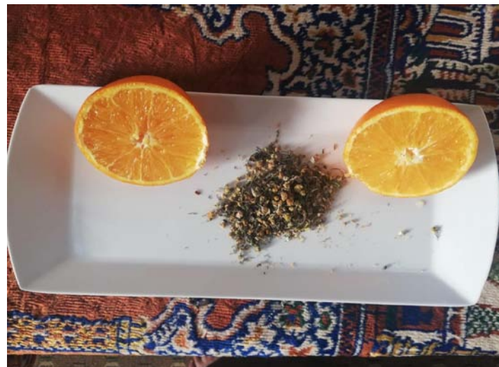
Figure 2. Anthemis hyalina (chamomile) and citrus sinensis (sweet orange) inhibit corona viruses replication